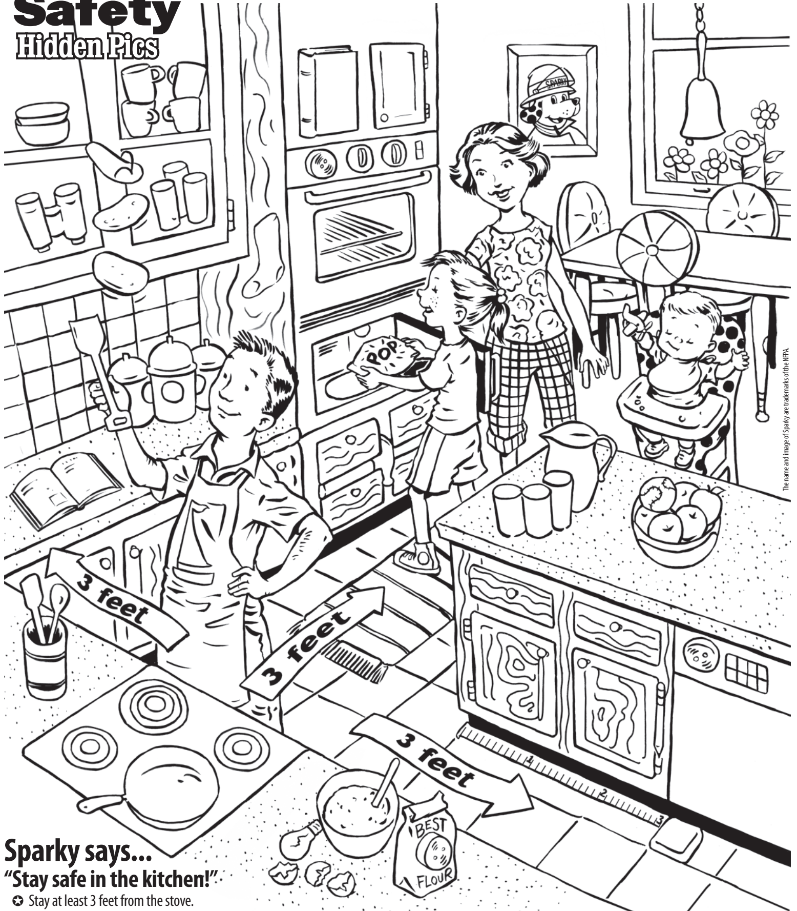
The name and image of Sparky are trademarks of the NPPA.

See if you can find: binoculars, flip-flop, sock, sand shovel, fire hydrant, sailboat, pizza slice, hammer, comb, book, ice cream cone, leaf, eyeglasses, baseball, banana, butterfly, lightbulb, bell, fried egg, beach ball, baseball bat, pencil, tape measure, 3 smoke alarms!