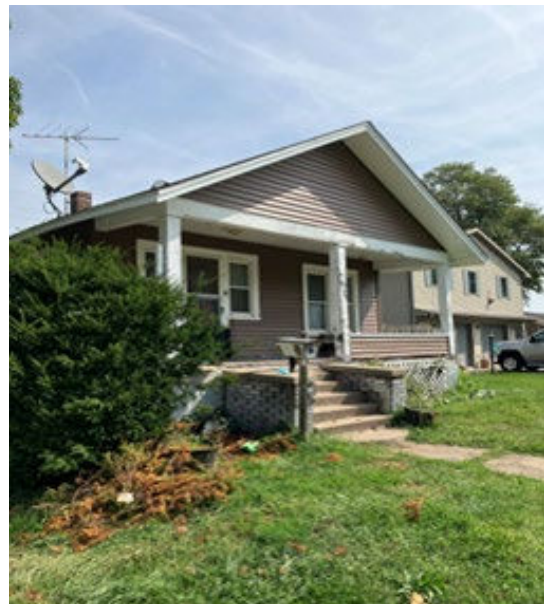
24. 1031 E. Jackson St.: Window Installation Total: $10,550.00 City: $9,495.00