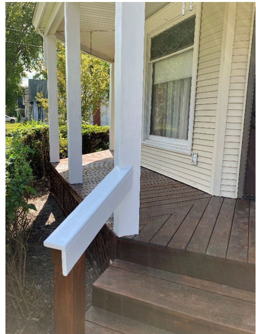
31. 716 S. Charles St.: siding, roof Total: $26,850.00 City: $10,000.00