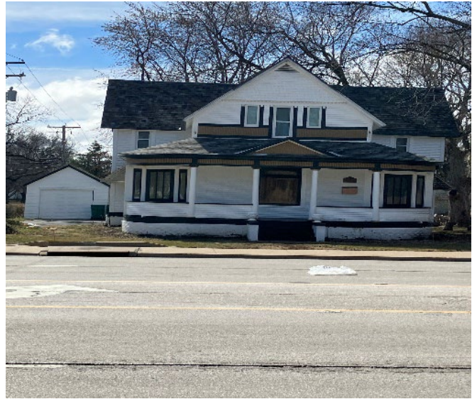
25. 201 W Barsi Blvd: Siding + Labor Total: $11,000 City: $9,9000