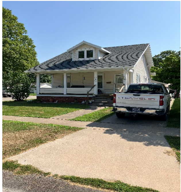
29. 712 E Jefferson St.: Siding, gutters Total: $12,500 City: $10,000