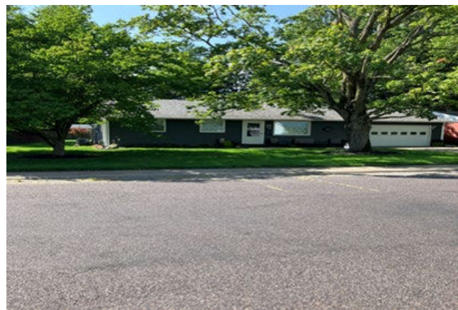
26. 629 S Randolph St: Porch, rotten wood removal, new brace installation Total: $9,875 City: $8,887.50