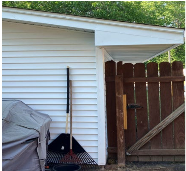
30. 336 S. Dudley St.: porch, paint, porch supports Total: $13,520.00 City: $10,000.00