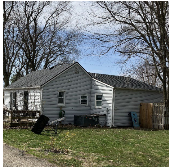
32. 624 S. Johnson St.: Repainting & tuck-pointing Total: $9,030.00 City: 8,127.00