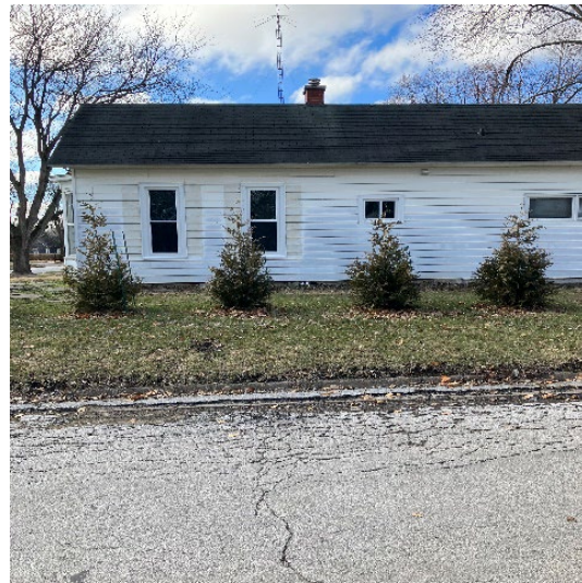
23. 1020 E. Elm St.: Siding Total: $16,306.91 City: $10,000